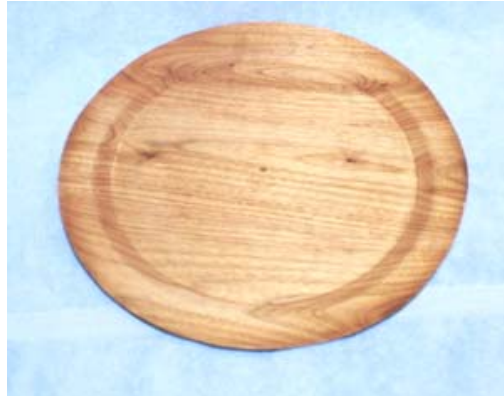
Art Pataky - 15-inch platter made from Burmese teak and finished with Wadco oil.