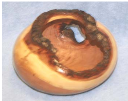
Steve Spurlock - Natural-edge vessel made from wild cherry and finished with tung oil