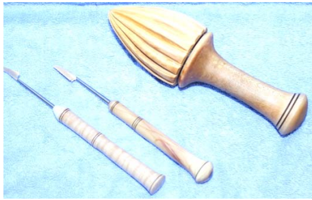
Guy Gerrard Citrus reamer of maple: two scribing awls, one of maple and one of lilac. All finished with Minwax wipe-on