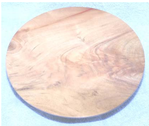
Stuart Lillie Platter of walnut and finished with Watco Danish oil.