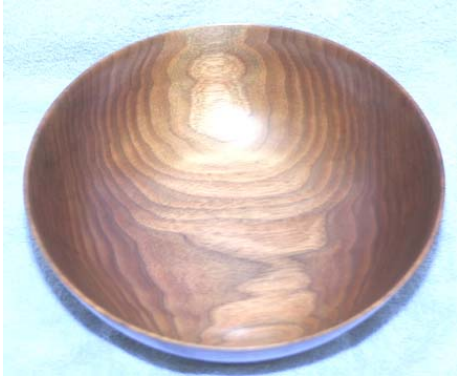
Harvey Driver Thin-walled bowl made of walnut. Finished with Danish oil and Beall