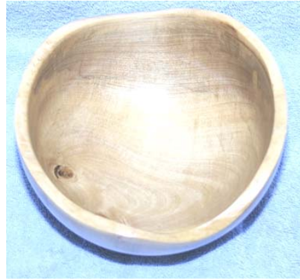
Harvey Driver Natural-edge bowl of citrus wood. Fin- ished with Dan- ish oil and Beall buff