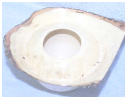
Steve Spurlock Hollow vessel made from local maple and fin- ished with tung oil