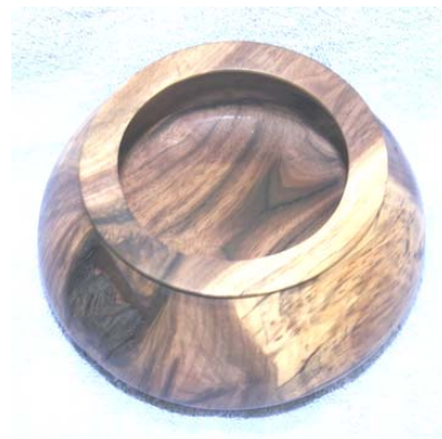
Stuart Lillie Bowl of Florida cherry with crotch figure. Finished with