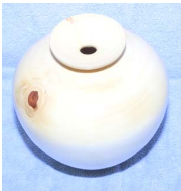
Gene Gross Hollow form of Norfolk Island pine bleached with 2-Part Bleach