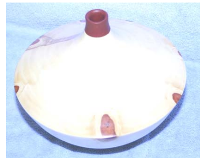
Gene Gross Hollow form of Norfolk Island pine bleached with 2-Part Bleach